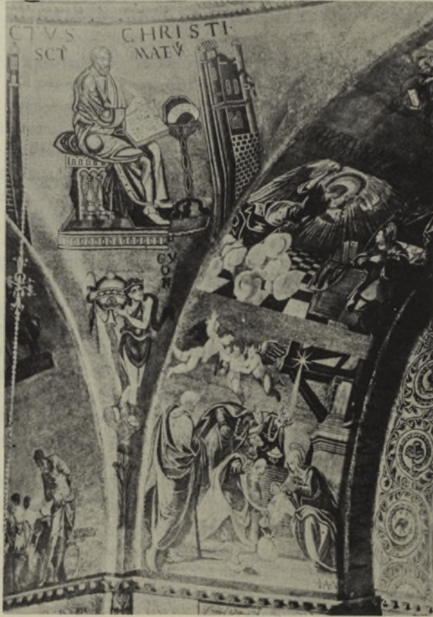
FIGURE 1. One of the four spandrels of St Mark's; seated evangelist above, personification of river below.

The design is so elaborate, harmonious and purposeful that we are tempted to view it as the starting point of any analysis, as the cause in some sense of the surrounding architecture. But this would invert the proper path of analysis. The